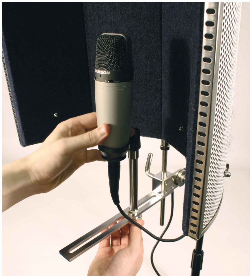
The Reflexion Filter is designed to attach to the same stand as your vocal mic.

Firstly, if the singer works close to the Reflexion Filter, the sound will still be picked up as normal by the microphone but a lot less of the acoustic energy will be able to escape out into the room. This in turn reduces the energy of the reflected sound, which helps dry up the recording. Secondly, even cardioid mics pick up a significant amount of sound from the sides, so placing a cardioid mic within the curve of the Reflexion Filter will help keep out room reflections approaching from the side. Depending on how good, or otherwise, your room is, you may be able to make a perfectly acceptable vocal recording using just the Reflexion Filter to control the acoustic environment, but my own approach would be to combine the Reflexion Filter with some improvised absorption behind the singer — which could be as simple as a suspended sleeping-bag or duvet. This would help absorb any of the voice that managed to reflect after getting past the filter and would also prevent sound sources elsewhere in the room reflecting from the wall into the live side of the microphone — for example, computer fan and drive noise. With the Reflexion Filter screening off the rear and sides of the mic, this should lead to a significant improvement in both the acoustics and the amount of unwanted room